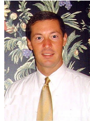
President of the Tulsa Hotel & Lodging Association

His Hotel web site is: http://marriott.com/